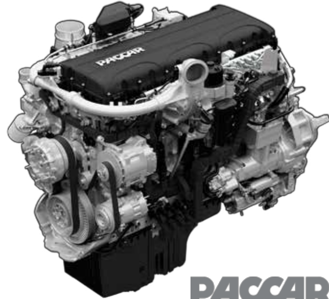
PACCAR MX-11 Powered By Quality

PACCAR's 50 years of diesel engine development and manufacturing expertise has established the company as one of the leading diesel engine manufacturers in the world. PACCAR engines have accumulated over 50 million miles of field testing — in the most severe of conditions in North America — resulting in an engine durability B10 design life of 1,000,000 miles. This level of quality and durability increases the time before a major overhaul is needed — resulting in exceptionally low life cycle costs. PACCAR Engines are built in Columbus, Mississippi at a state-of-the-art engine manufacturing, machining, and assembly facility.