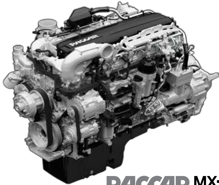
PACCAR MX-13 Powered By Quality