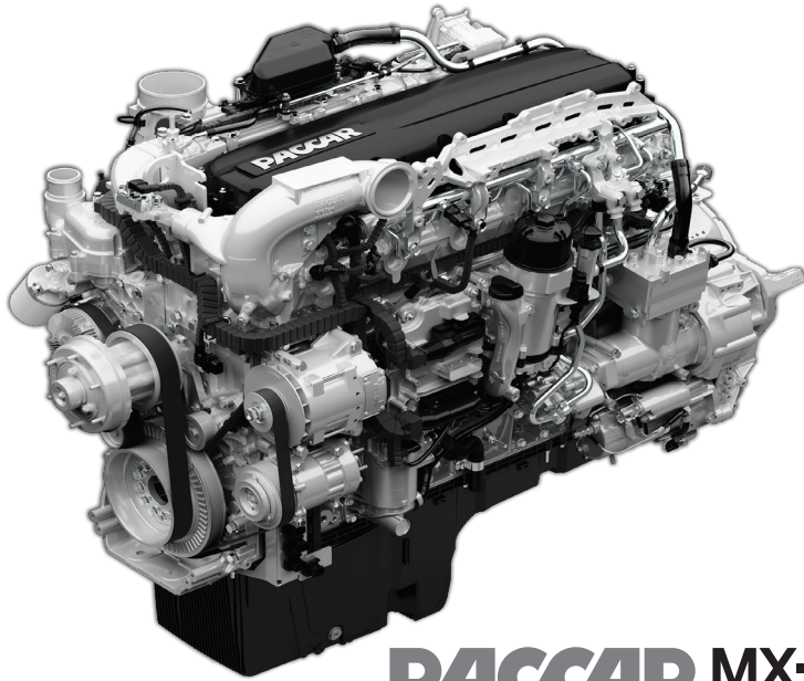
PACCAR MX-13 Powered By Quality