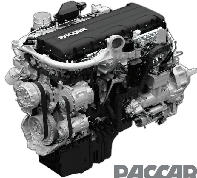
PACCAR MX-11 Powered By Quality

PACCAR's 50 years of diesel engine development and manufacturing expertise has established the company as one of the leading diesel engine manufacturers in the world. PACCAR engines have accumulated over 50 million miles of field testing — in the most severe of conditions in North America — resulting in an engine durability B10 design life of 1,000,000 miles. This level of quality and durability increases the time before a major overhaul is needed — resulting in exceptionally low life cycle costs. PACCAR Engines are built in Columbus, Mississippi at a state-of-the-art engine manufacturing, machining, and assembly facility.