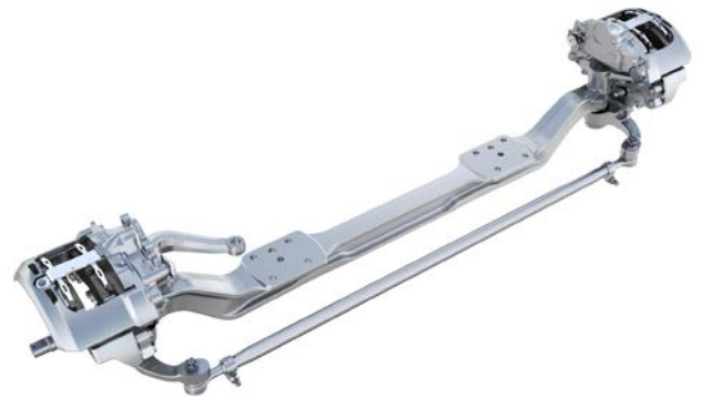
Meritor MFS+ Front Steer Axle with Disc Brakes

The new design also reduces space constraints for easier access by technicians. The MFS+ is designed for mounting each brake at “12-o'clock” for easy removal. Overall the MFS+ with integrated torque plates and tie rod arms may reduce weight by up to 85 lbs. – depending on brake and axle configuration – resulting in increased payloads.