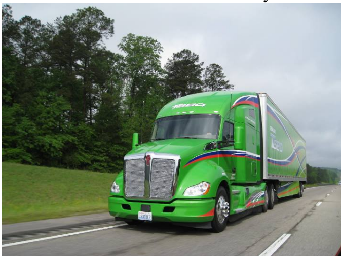
Kenworth T680 Advantage