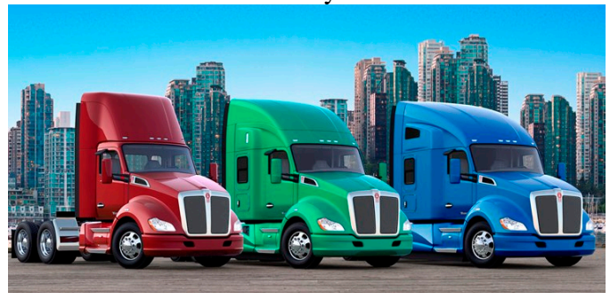
From left: Kenworth T680 day cab, T680 52-inch sleeper, and T680 76-inch sleeper.

The PACCAR MX-13 engine with the Eaton Fuller Advantage 10-speed automated transmission is the standard combination for the new Kenworth T680 Advantage, which combines optimized engine and transmission with aerodynamic enhancements for even better fuel economy.